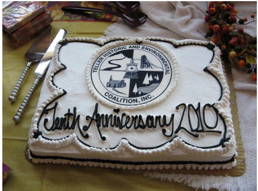
The cake tasted as good as it looked!

A grand cake was enjoyed by those attending. Discussion featured the accomplishments of THE Coalition since its inception in 2000, including the ongoing project of restoring the Midland Depot at Divide. In addition, a new and ambitious project was launched to further explore the historic, environmental, cultural, and recreational goals of THE Coalition—"Heritage Tourism for Teller County."