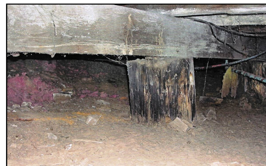
The Midland Depot at Divide foundation – scorched stumps and beam from the 1880s that still support the Depot

The stabilization plan involves jacking up the Depot, pouring a modern cement foundation (or using concrete blocks), replacing rotted floor beams and joists and then placing the Depot back down on a more solid footing. There is much challenging work to be done by T.H.E. Coalition and others before the Midland Depot at Divide opens once again as a viable, preserved reminder of our railroad past. But we, with help from the community, are up to it!